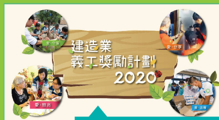
Construction Industry Volunteer Award Scheme 建造業義工獎勵計劃

Please refer to the CIESG website for more ESG activities and schemes. 請即上服務網站查閱更多ESG活動及計劃詳情。