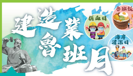
Lo Pan Service Month 魯班服務月