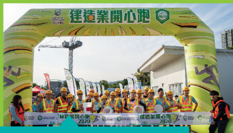
Construction Industry Happy Run and Carnival 建造業開心跑暨嘉年華