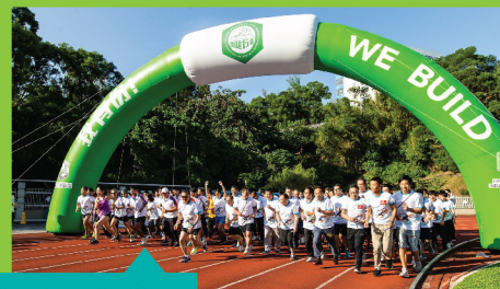
Construction Industry Sports Day and Charity Fun Day 建造業運動會暨慈善同樂日